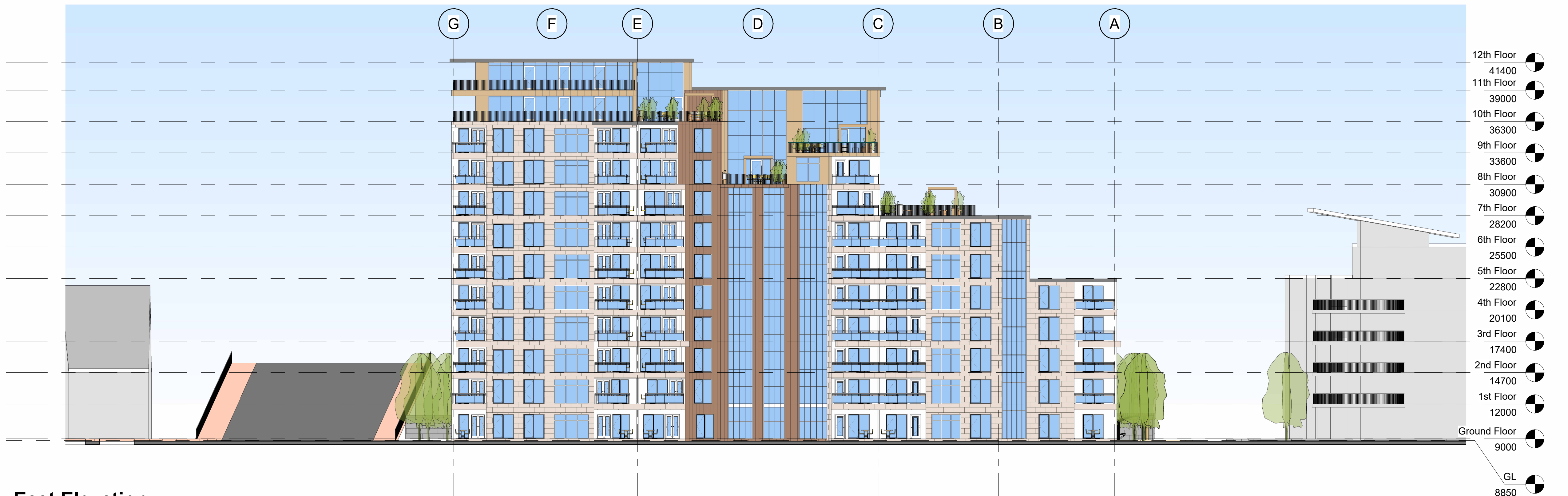
East Elevation 1 : 200